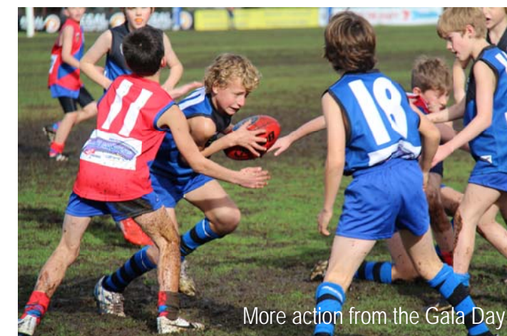
More action from the Gala Day