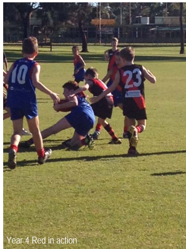
Year 4 Red in action