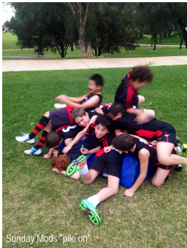
Sunday Mods "pile on"